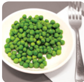
½ cup peas