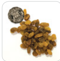
1½ tablespoons sultanas