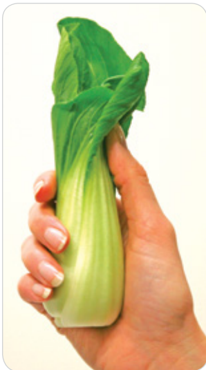
1 bok choy

A: See the fact sheet Fruit and Vegetables , as well as the Go for 2 and 5 website, www.gofor2and5.com.au , for lots of ideas for snacks, meals and desserts.