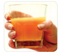
125 mL 100% orange juice

This fact sheet provides general information only and is not a substitute for individual health advice. You should talk to your doctor or dietitian about your specific situation.