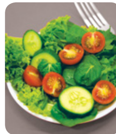
1 cup salad